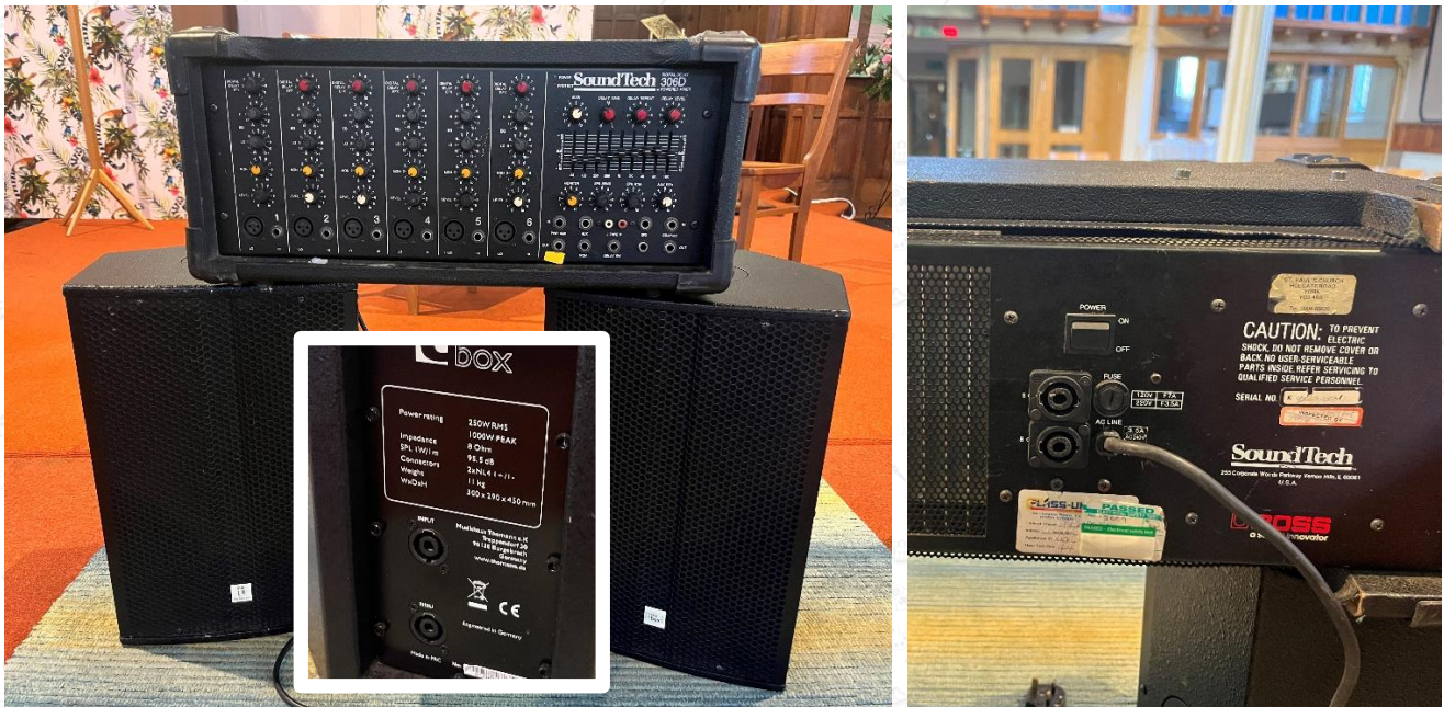
Mixer Amp, front and back (inset – speaker back)